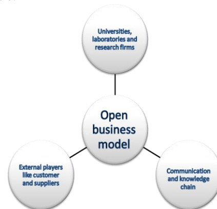
Fig. 2. Open innovation collaborative network.

Currently, technology has enabled external creativity to be incorporated in new invention and even in enhancing sound decision making. As regards to external integration, food processing companies are slowly integrating external players such as research centers, universities, customers and laboratories. This incorporation has dramatically increased creativity and innovative strategies when making decisions. As illustrated in Fig. 2, external player incorporation serves to provide a platform for tapping business environmental changes. This network has increased innovative intensity which enhances competitive advantage. Firms in this model must strive to tap flow of new technology from innovative process technology. Firms must devise new policies to enhance tapping of new technology from technological networks [12]. Another advantage of open innovation is that, it allows firms to concentrate on product differentiation and customer satisfaction since they all share a common innovation. Three of the influencing factors involved in carrying out open innovation business model in the food industry are: