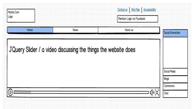
Fig. 3. Suggested home page of MyAds.

The system should take into consideration accessibility issues and have a simple but coherent design. Fig. 3 is a snapshot of how the suggested system's main page would look like.