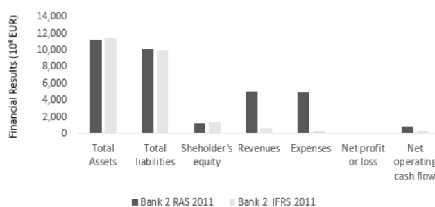
Fig. 2. Differences between RAS and IFRS for Bank 2.

In terms of net profit or loss, the results recorder by Bank 2 under RAS (EUR 110 mil.) are close to those recorded under IFRS (EUR 102 mil.).