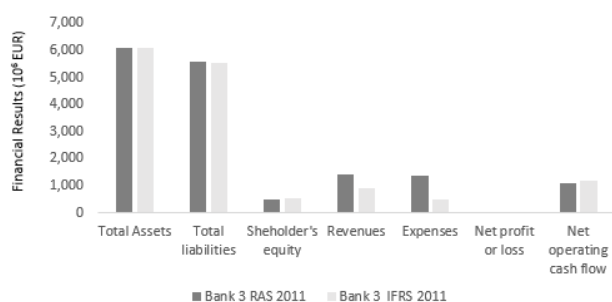
Fig. 3. Differences between RAS and IFRS for Bank 3.

As a general observation we can say that for the 3 most important banks in Romania, the results recorded under RAS tend to be similar with those recorded under IFRS, in terms of total assets, total liabilities, shareholder's equity and net operating income. The financial elements with disruptive results recorded under IFRS and RAS are the revenues and expenses where results are higher under the national system than the international referential, all 3 banks displaying in their income statements the corrections related to provisions, receivables and financial instruments.